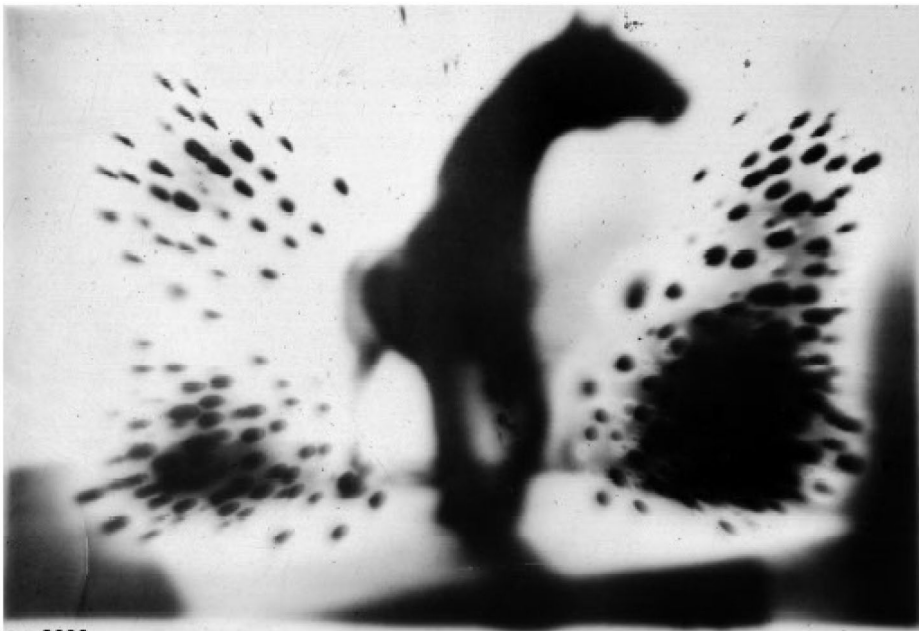
Teseo2000 Cm 100x70 photoprint on baryte paper Solo Show 2000 Gall S.A.L.E.S. Rome_2000 Gall R.Cortese , Milano